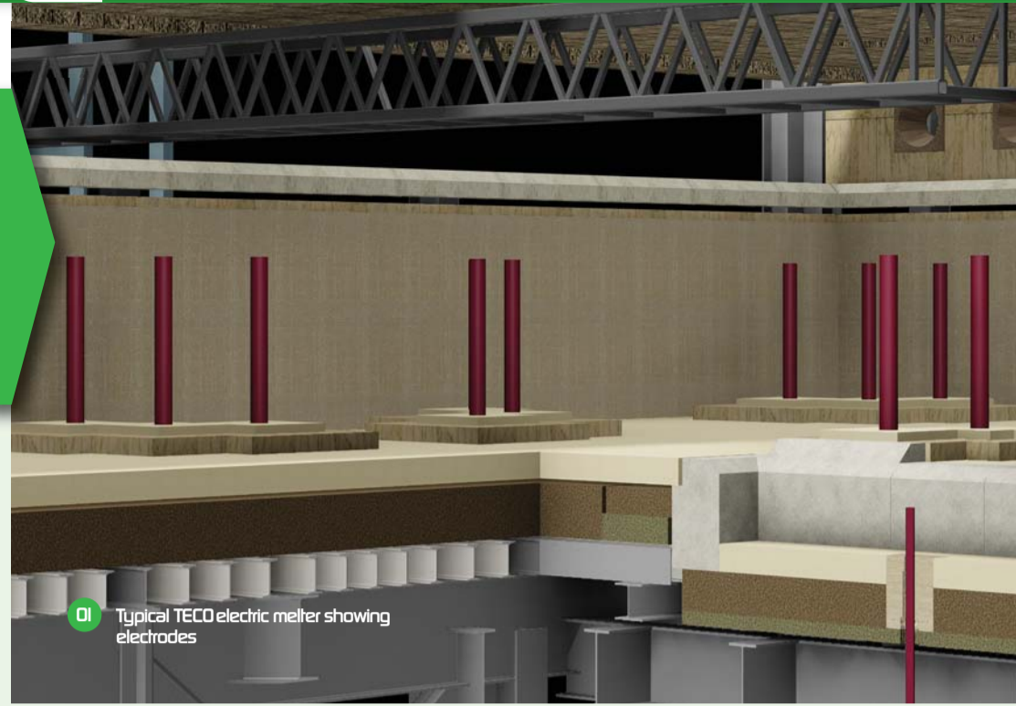
01 Typical TECO electric melter showing electrodes