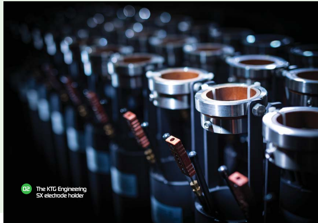
02 The KTG Engineering SX electrode holder

E L A Z X C T D E J I Z E D T E C B G D E E V R L E G I S L A T I O N B V X I C L V P U I O K L E M C E A Q U I J E A C H R E S I C E C U E L E C D E I Y C V F V S N O I S S I M E X Z M P A Y T A R G E T S O N W Q U Y O O L A S S R Z B O P R E A P A R I S A G R E E M E N T V Y O C R M A I W Y V C E E S P L C L G T M C E D A N R E A L C A R B O N X I B A G E W I G E C L E A N T A M B Q E W P E O L E A A C W A N E H Z X C V B N Y O D D G A W E F L L I T F T M E A P L K J Y T E O J U R L A P U M K N R E F U R N A C E X A E R S A C E A B L E E T I I P R E C G C F G H J K Y T H E E M L R L E G A C M O Y Y E A E Y E C E C E C U I A E B V X E W I R Q L U T B X Z E O P P Z W S C V S N M O N O T Y M P L A N E T R A E L G A Y E O A W S L G N Y Q U F N U Z X C B N K I T Y H Y I S G Y T I L I B A N I A T S U S E C S J H J K U D H M E N L K J H G F D S I A E D I C S J O I Y F J U Y E A E T E C H Z X C O V B N M A M P A T G K J G E P O I U Y T Y G R E N E M E D N L E R H P U O R G O C E T T R E W Q N M D S V B L D E J K M W I Q S X W D V E F B R G N T H T B Q D R T N E M N R E V O G Q A Z X C U J Q B E A C W D T E C O G L A S M K G D E F R G T A P